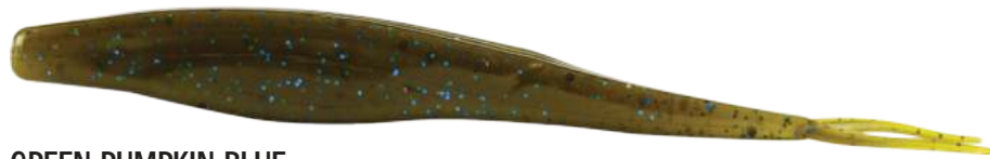
GREEN PUMPKIN BLUE