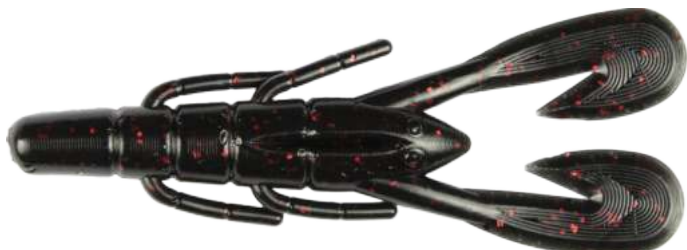
BLACK RED FLAKE