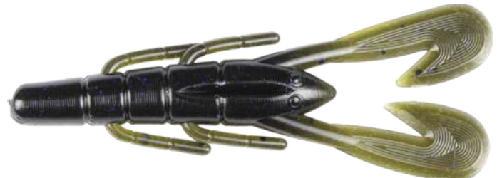
BLACK GREEN PUMPKIN