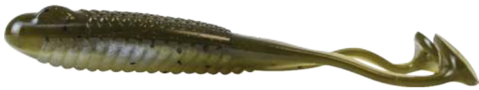
GREEN PUMPKIN PEARL