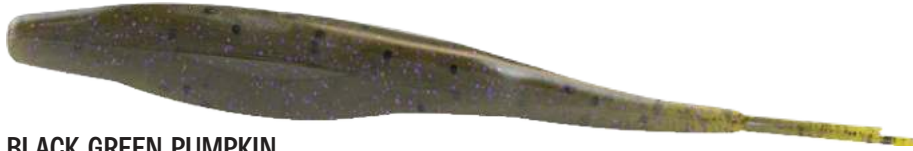
BLACK GREEN PUMPKIN