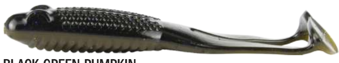
BLACK GREEN PUMPKIN